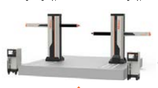
CARBstrato/CARBapex Horizontal Arm Measuring Systems