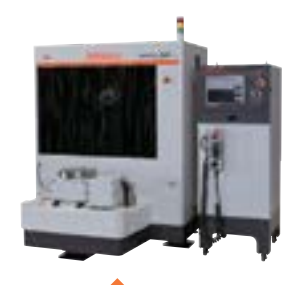
MACH-3A In-line Horizontal Arm CMM