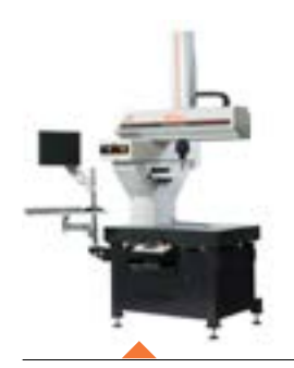
MiSTAR 555 Shop floor CMM

Mitutoyo offers a comprehensive line-up of CMM systems, probing systems and powerful software.