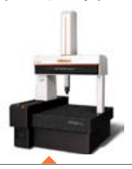
STRATO-Apex High-Accuracy CNC CMM Moving bridge-type