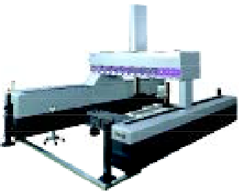
FALCIO-Apex High-Accuracy Large CNC CMM