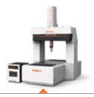
Legex Ultra High-Accuracy CNC CMM Fixed-bridge type